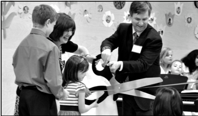
Adams Road officially opened with visits from Mayor Watts and Minister of Finance & Deputy Premier, Hon. Kevin Falcon. Minister of Education, George Abbot assisted with the ribbon cutting.